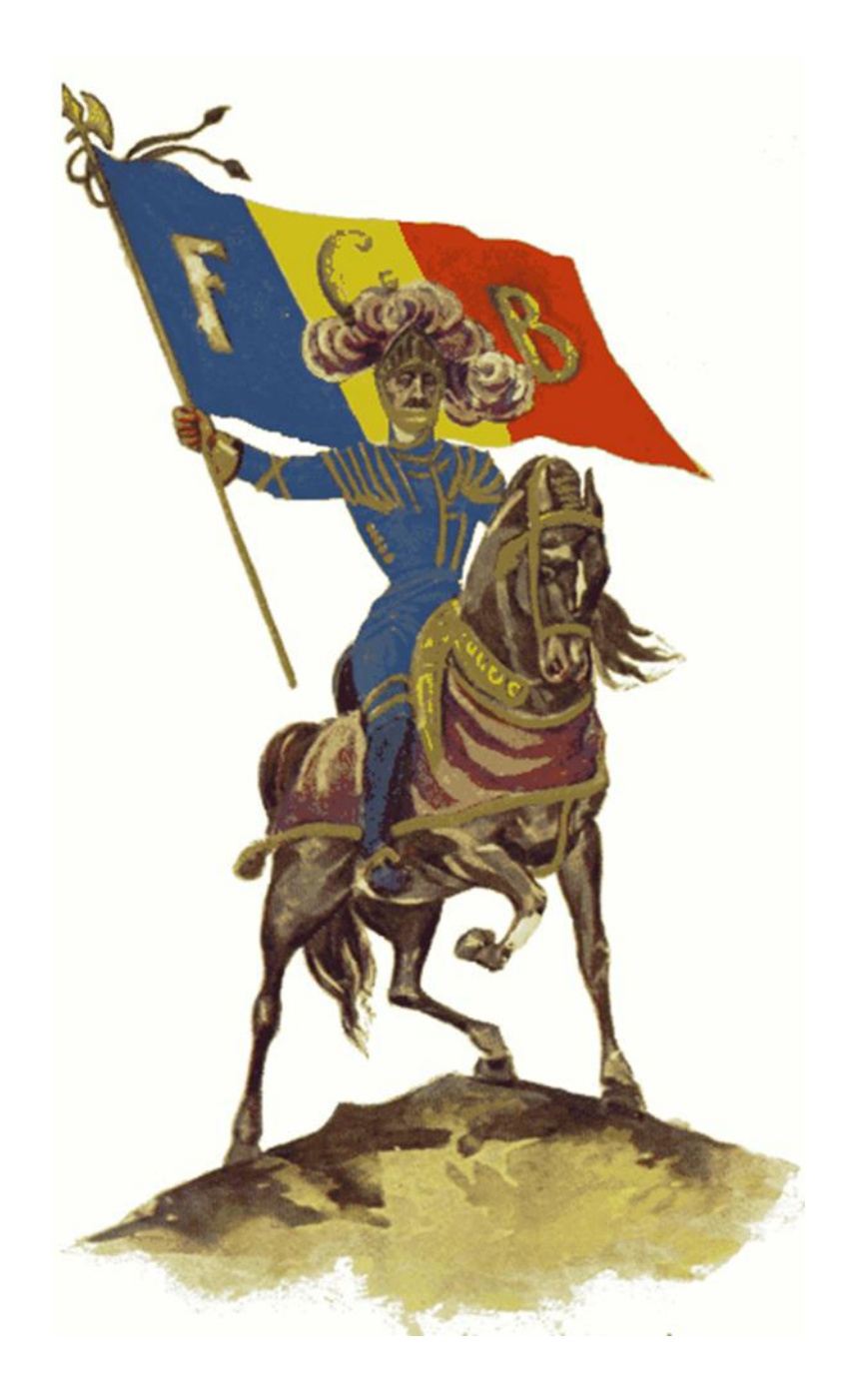
Stay strong. Stay true. Stay PYTHIAN!